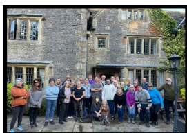
The Big Ramble 2 October 2022