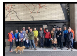
Manchester Peace walk September 2022

NEXT STEPS: We need to continue to raise funds to cover the cost of wages and to ensure we have the money to support the project as it develops and as it begins to cover its own wage and operational bill from the sale of some of the produce.